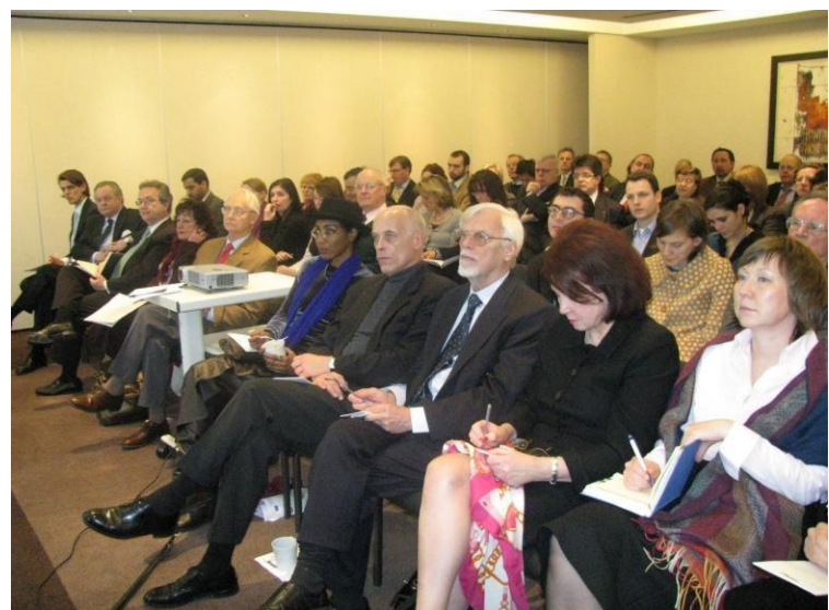
Islam and the EU: A crowded plenum