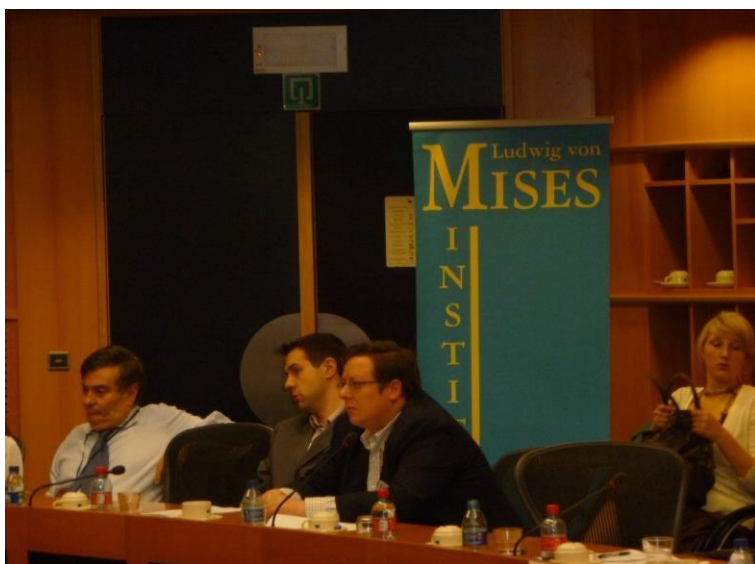
10 June 2008 conference in the European Parliament: "How Can Europe Profit from China's Rise?"