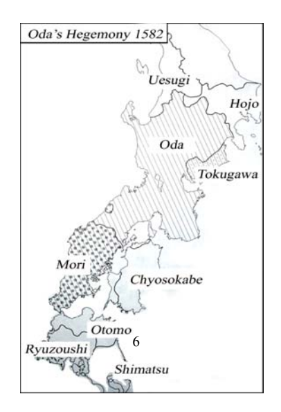
Figure 2. The Peak of Oda hegemony in 1582

Oda legislated the first free trade market in Gifu in 1567. Another free market area was established a year after the construction of Azuchi Castle in 1577. Since 1569, when Oda beat the Kitagatake, Oda controlled the Ise bay, one of the most important coasts in central Japan. When Kyoto was under Oda's control, he also facilitated roads both over land and over sea, benefiting not only the army but goods transportation too. After Oda's death, Hashiba (Hideyoshi Toyotomi) continued his policy.